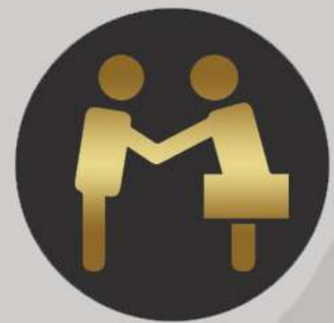
MEET & ASSIST